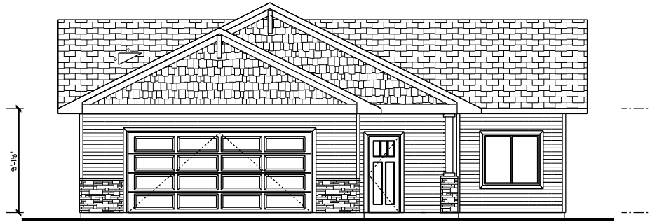
FRONT ELEVATION 3/16" = 1'-0"