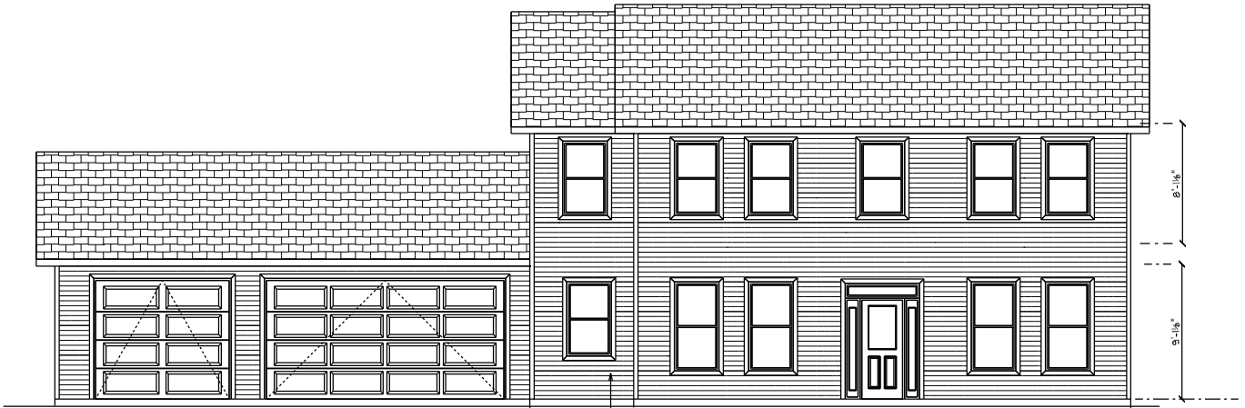
FRONT ELEVATION 3/16" = 1'-0"